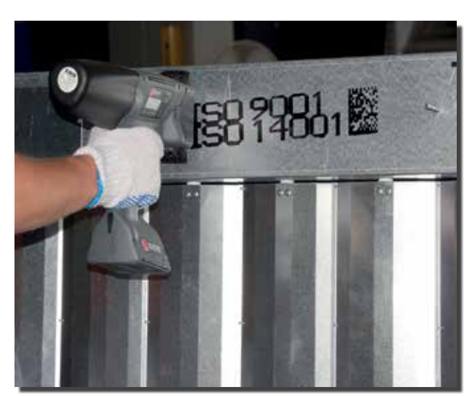
Prints on steel - 2D barcode - with black universal ink

EBS Ink Jet Systeme GmbH has been developing leading-edge industrial printing systems and consumables since 1977.