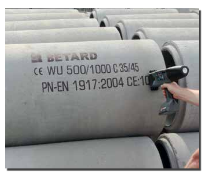
Prints on concrete with special UV-resistant black ink