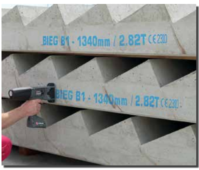
Prints on concrete with blue pigmented ink