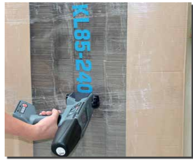
Prints on stretch wrap with pigmented ink